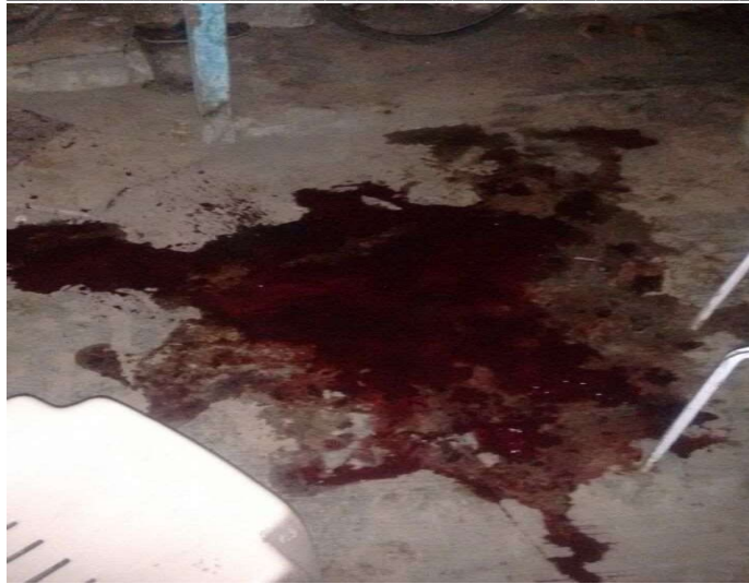
Image 3 Blood spurting at the crime scene.