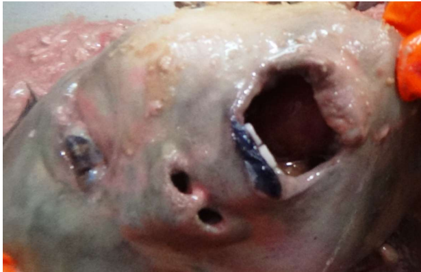
Fig.1: Intact whole Onion in Oral cavity

The mother of the girl knowing the exact incident could not forgive the assailant father whose act resulted in death of her daughter. She consulted the child's maternal grandfather and lodged the police complaint after two days. Afterwards, exhumation was carried out and autopsy was conducted in mortuary of Government medical college, Aurangabad on third day after the incident.