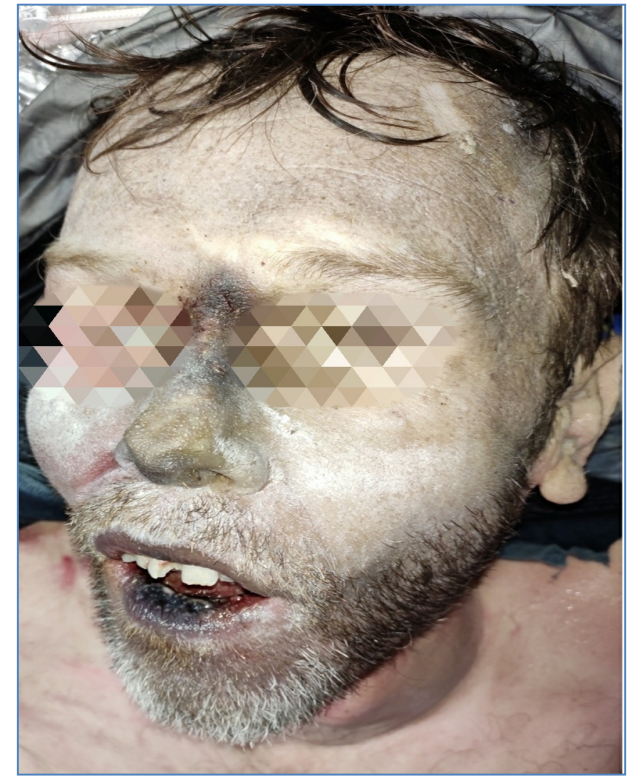
Figure1: Pale area surrounded by hyperaemic areas and black discoloration of bridge of nose.

On 3 June 2019 after search IAF helicopter spotted five bodies but due to inclement weather immediate recovery was not possible. On June 23, 2019 seven bodies were recovered by ITBP team after 20 days search 'operation daredevil'. On 3 July 2019 all the bodies were taken to Haldwani for Medico-legal autopsy and identification. The post mortem was conducted by panel of three doctors on requisition from police and videography was done.